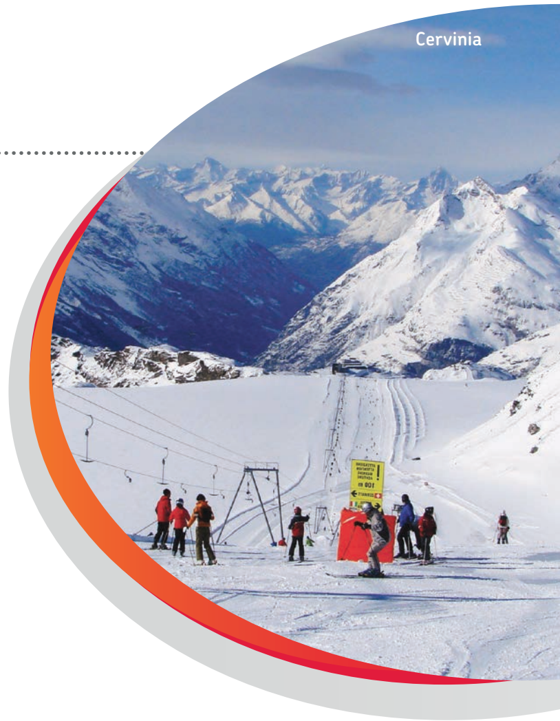
Figure 5 Best for beginners